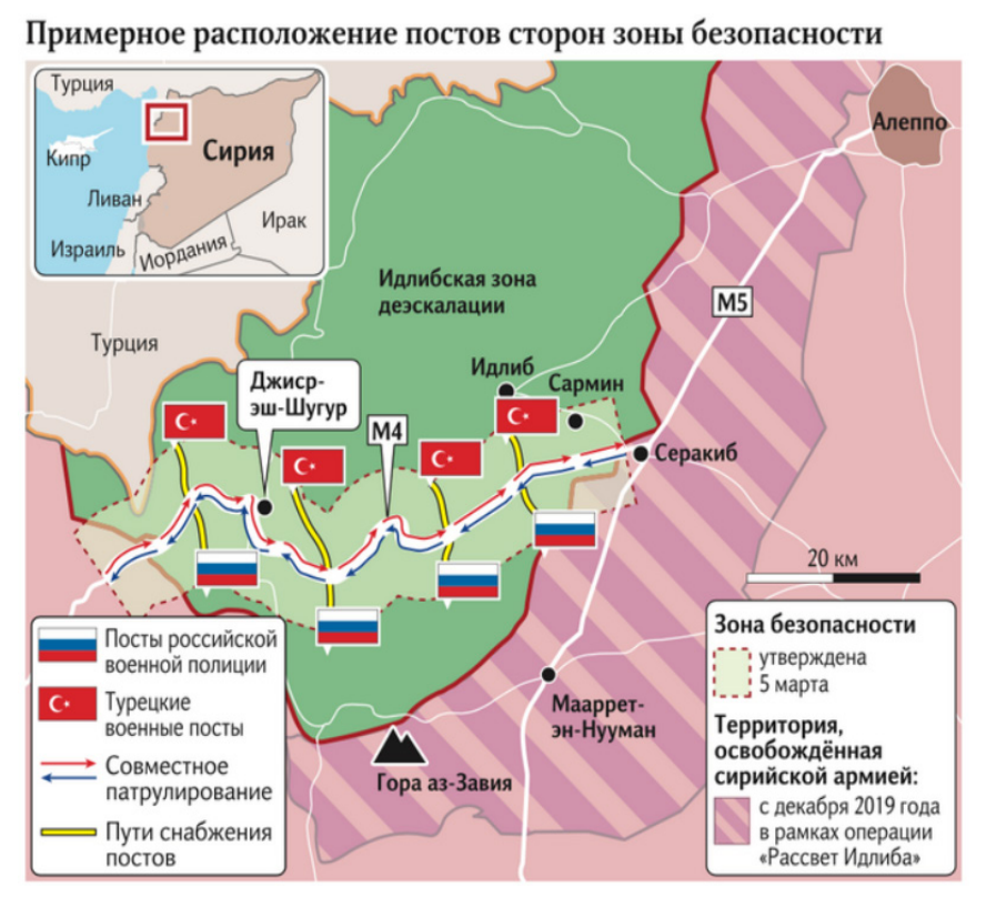
Map: Russian-sourced Security Corridor[60]

· Russia and Turkey will begin joint patrols along a portion of the M4 Highway on March 15