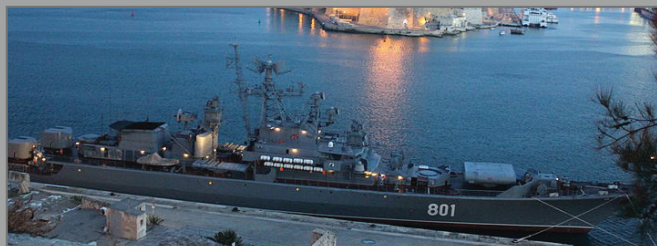
LADNY, KRIVAK CLASS FRIGATE, JANUARY 2012.