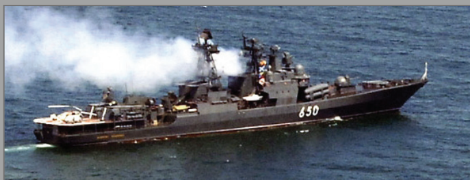
ADMIRAL CHABANENKO, UDALOY CLASS DESTROYER, JANUARY 2012. SOURCE: WIKIMEDIA COMMONS