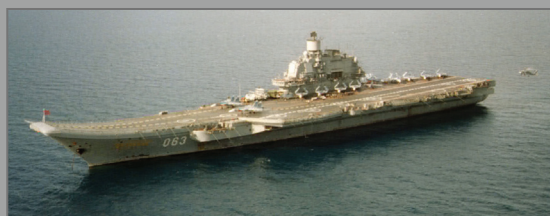
ADMIRAL KUZNETZOV, RUSSIAN AIRCRAFT CARRIER (ANCHORED OFFSHORE, JANUARY 2012.)

provides similar capabilities to Tartus. 28 At the same time, Russia is significantly increasing its industrial cooperation with former European foes. In 2010, the Russian Navy announced plans to buy Mistral class amphibious assault ships built by STX, a Korean owned shipbuilding company located in St. Nazaire, an Atlantic port in France. 29 On July 12, 2012, initial designs were completed, with construction scheduled to begin in September of 2012. STX will build the first two ships in St Nazaire, and at the same time will build a new, modern shipbuilding facility in St. Petersburg, Russia, where the next two ships will be built. 30 This level of industrial cooperation between France and Russia indicates that Russian Navy vessels may, in this sense, be allowed regular access to French ports in the near future. Russia does not necessarily need a proprietary port in the Mediterranean in order to conduct deployments in the Mediterranean.