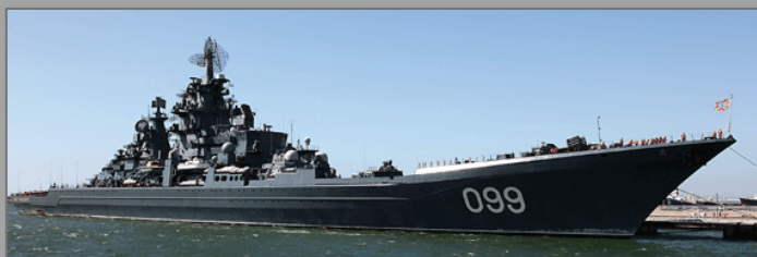
PETER THE GREAT, KIROV CLASS BATTLECRUISER, APRIL 2010.