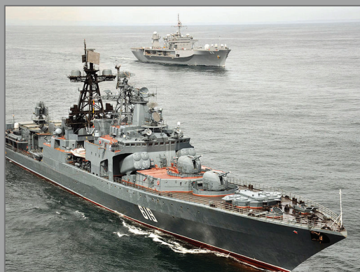
SEVEROMORSK, UDALOY CLASS DESTROYER, SEPTEMBER 2011.