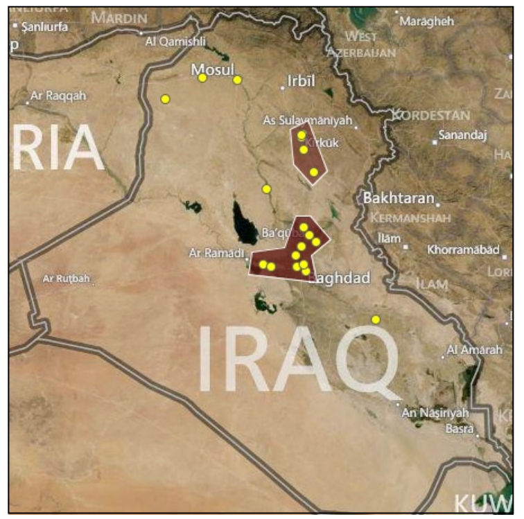
FIGURE 2 | WAVE TWO - AUGUST 16

The July 23 attacks killed over 115 people in and around at least 20 cities in over 30 coordinated attacks that struck the central and northern provinces of Iraq.<sup>9</sup> The attacks were predominately vehicle-born IEDs (VBIEDs) with a few instances of small arms fire at security checkpoints. While the exact timing of each attack is difficult to determine, most appear to have occurred during the morning hours of the day.<sup>10</sup> This would indicate a high level of coordination to detonate 30 VBIEDs within this short period. The geographic concentration of the July 23 attack, like that of the first four attack waves in 2012, centered on Baghdad, Diyala province, Kirkuk city, and Mosul, areas that had been significant ISI strongholds during its peak in 2006." They are also areas that can be easily resourced through use of historic AQI supply lines radiating out from Baghdad to outlying cities such as Taji, Baquba, and al-Khalis. The July 23 attack wave was quickly followed by a written statement titled "An announcement on the First Wave of the 'Destroying the Walls' Operations" in which ISI claimed responsibility for the "simultaneous and coordinated jihadist operations" that "swept the length of the country." 12