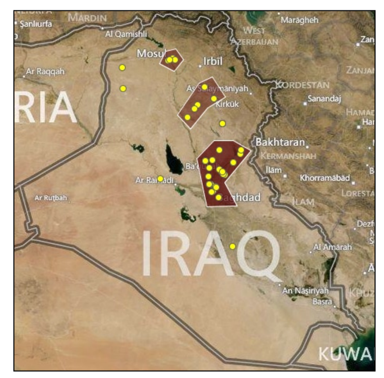
FIGURE 1 | WAVE ONE - JULY 23

24 day interval, which is a significant rate increase as compared to the previous four attack waves in 2012 that were separated on average by 37 days. Furthermore, the newest attack wave expanded geographically from Mosul to Basra. The September 9 bombings were particularly significant as the first ISI attacks to strike the predominately Shi'a areas of southern Iraq since the ISI suicide bombings in Nasiriyah and Basra in January 2012. Furthermore, the September 9 attack wave demonstrates a nationwide command and control capability to synchronize attacks from Mosul and Kirkuk in the north to Basra in the south.<sup>8</sup>