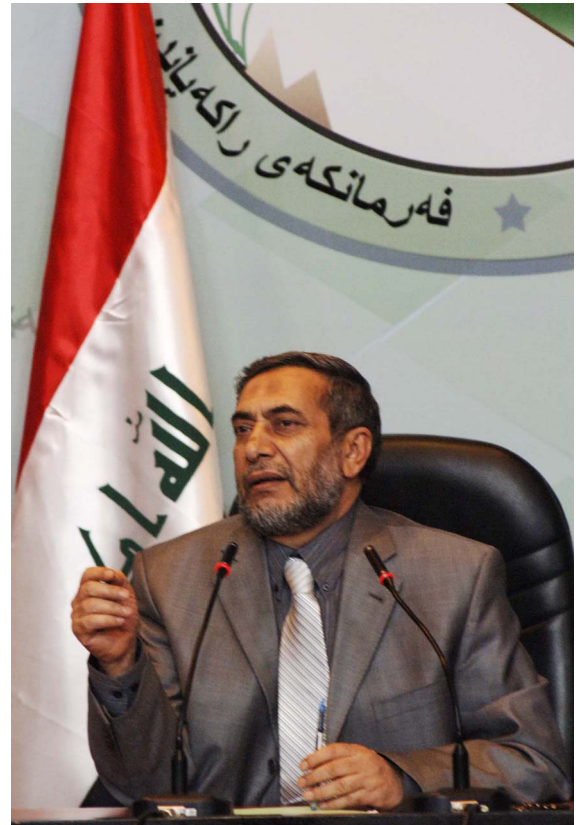
Photo: Former Speaker of the Council, Mahmoud al-Mashadani. (U.S. Department of Defense Photo)

Mashadani claimed that he was forced to resign as part of a plan to initiate a no-confidence vote against Prime Minister Maliki. Mashadani, therefore, suggested that his ouster was an orchestrated Parliamentary reaction to Maliki’s growing strength rather than a spontaneous reaction to his unstable temperament. 50 Mashadani, though Sunni, had been integral in backing Maliki and driving critical legislation through the CoR throughout 2008. 51 He also withheld any legislation that would adversely affect the Prime Minister. 52 He was therefore seen as an obstacle to any attempt to remove Maliki from office via a vote of no-confidence.