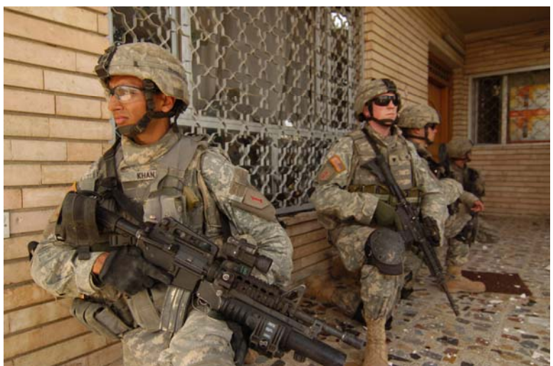
Photo 1: Soldiers from the 1-18<sup>th</sup> Infantry Patrolling in Saydiyah in May, 2007

The 1-18<sup>th</sup> IN continued to press Al-Qaeda in June, patrolling alongside elements from the 2<sup>nd</sup> BDE, 1<sup>st</sup> NP Wolf Brigade. There is considerable evidence that the Wolf Brigade has engaged in sectarian abuse of Sunni civilians, and evidence suggests that the relationship between the 1-18<sup>th</sup> Infantry and the NPs has been tense.<sup>79</sup> The most significant joint operation of the month, involving a detachment from the 1-38<sup>th</sup> Stryker Infantry, targeted two Sunni mosques, which were found to contain several weapons caches.<sup>80</sup> One of these mosques had previously come under attack by Shia militias in the area.<sup>81</sup> Al-Qaeda and Sunni remnants in the area continued to fight back; especially against fuel stations. An SVBIED targeted a gas station in Saydiyah on the 10<sup>th</sup>, followed by two SVBIEDs against a gas station on the road between Saydiyah and Mahmudiyah on the 18<sup>th, 82</sup> These were likely direct attacks against Jaysh al-Mahdi, which reportedly had established control over the gas stations in the area to divert revenue to militia activities.<sup>83</sup>