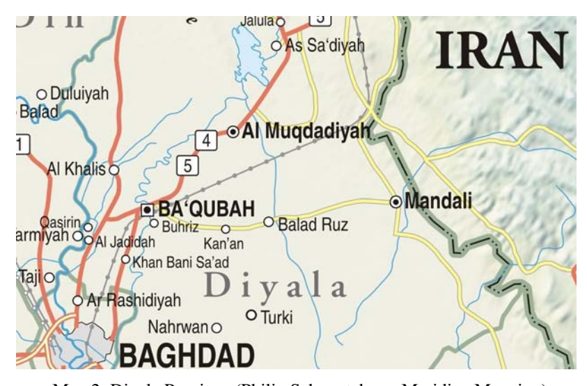
Map 2: Diyala Province (Philip Schwartzberg, Meridian Mapping)